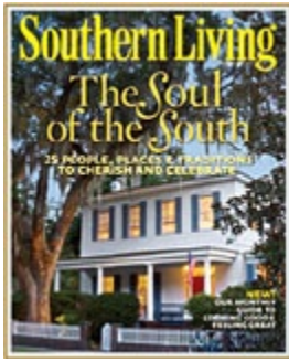
Open Gates B&B in Southern Living .